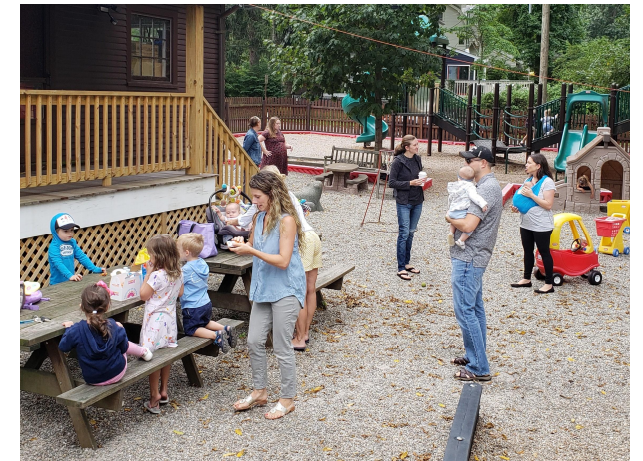
Playgroup September 2018